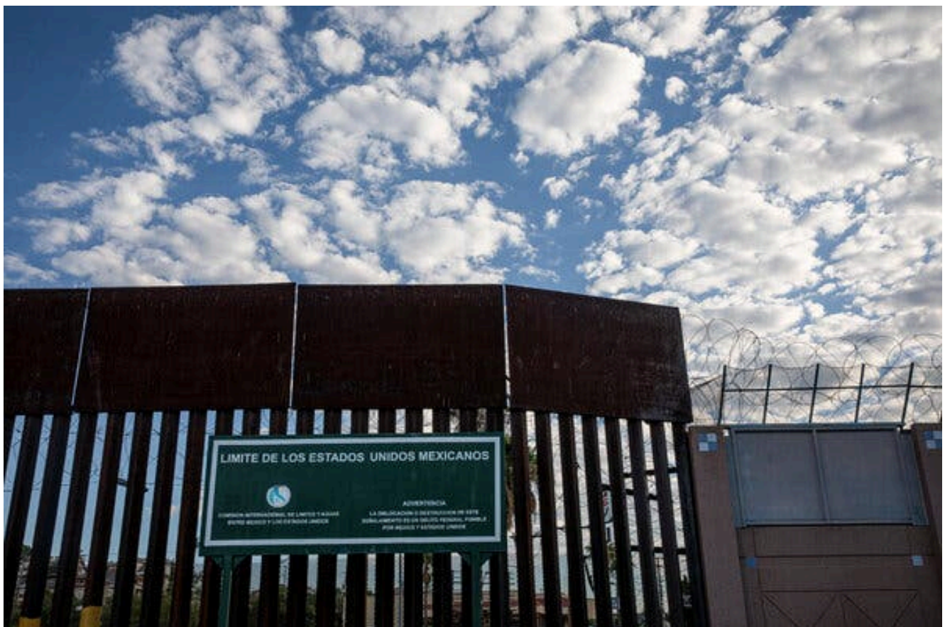
The Mexico side of the border wall in Nogales. In remote areas, far from cities,

Mr. Morgan touted the necessity of continuing to build the border wall, a project central to Mr. Trump’s political identity, to forestall illegal migration and the further spread of the coronavirus by infected undocumented immigrants.