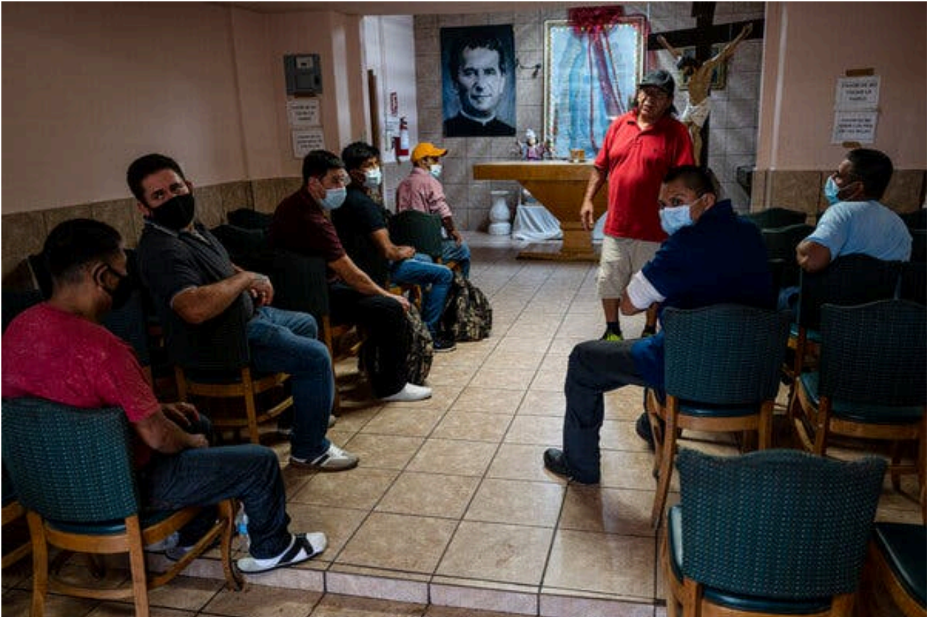
Newly arrived returnees at the San Juan Bosco migrant shelter in Nogales.