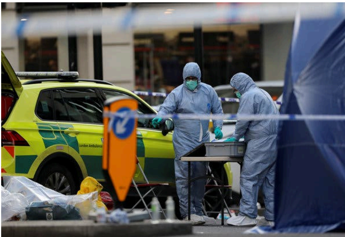
Forensic officers working at the scene of the attack.