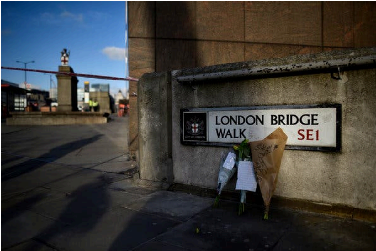
A flower memorial for the victims.

In 2017, when London Bridge and the nearby Borough Market were the subject of an attack, there was also a suicide bombing at the Manchester Arena, an attack on Westminster Bridge and at the gates of Parliament, and an assault at a north London mosque.