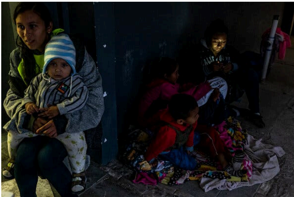
A migrant from Honduras, near the border in Juárez, Mexico, seeking asylum in the United States.

While tensions with Russia would likely rise, arms control is one area where Mr. Biden and Mr. Putin share a desire for progress. Mr. Biden is set to be sworn in just a few weeks before the scheduled expiration of the 2010 New Strategic Arms Reduction Treaty. He has said he wants to negotiate an extension of the treaty without preconditions.