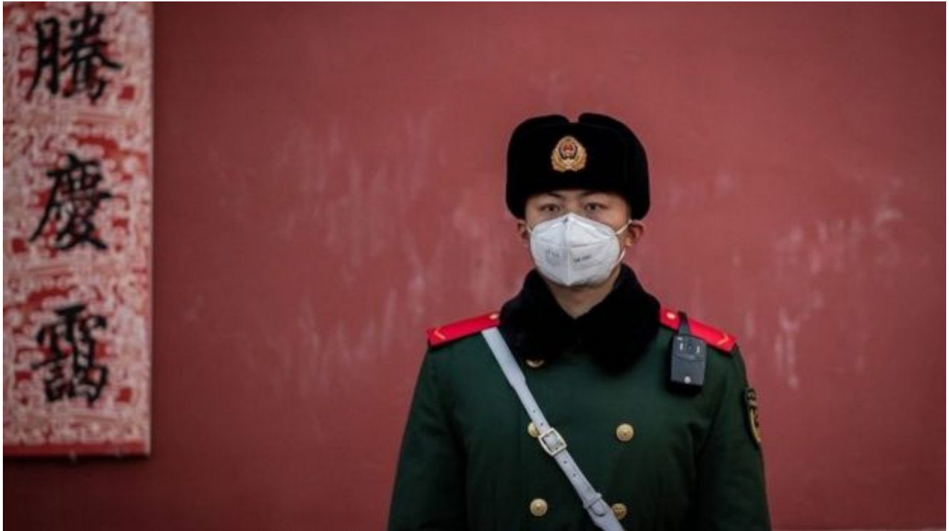
Image caption: The coronavirus has killed at least 56 people

The centre praised the efforts of the Chinese authorities but said transmission of the virus needed to be cut by 60% in order to get on top of the outbreak.