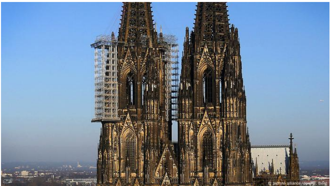
Cologne Cathedral, currently under repair

Church membership in Germany has been falling for years.