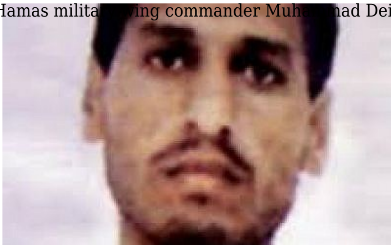
Hamas military wing commander Muhammad Deif

Sunday’s raid gone awry led on Monday and Tuesday to an unprecedented barrage of rockets and mortar shells fired by Hamas and other terrorist groups from the Strip that brought the region to the brink of another war.