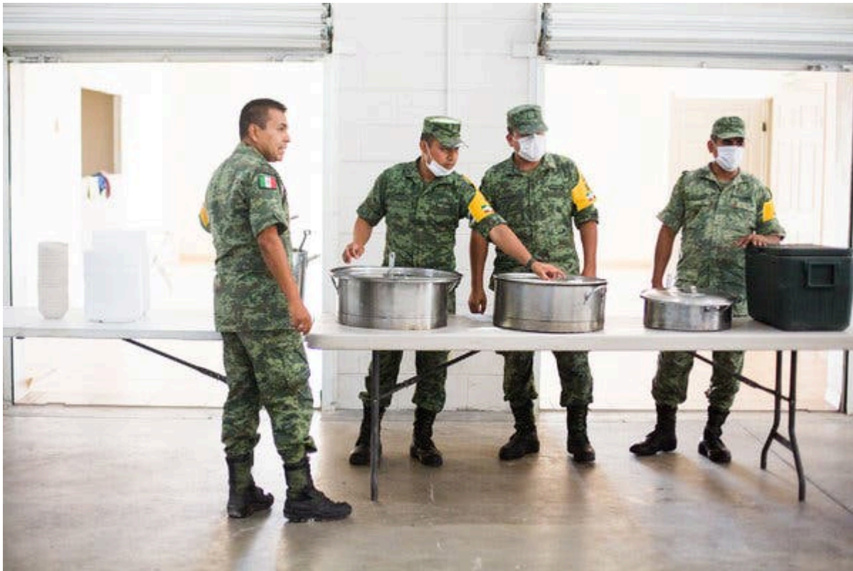
Mexican soldiers preparing lunch for migrants at a newly opened shelter in Ciudad Juárez.