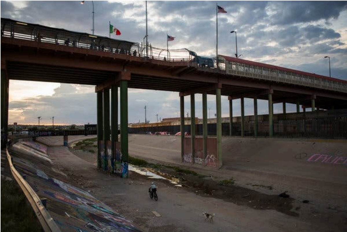
A pedestrian bridge connecting Ciudad Juárez to El Paso, Tex.