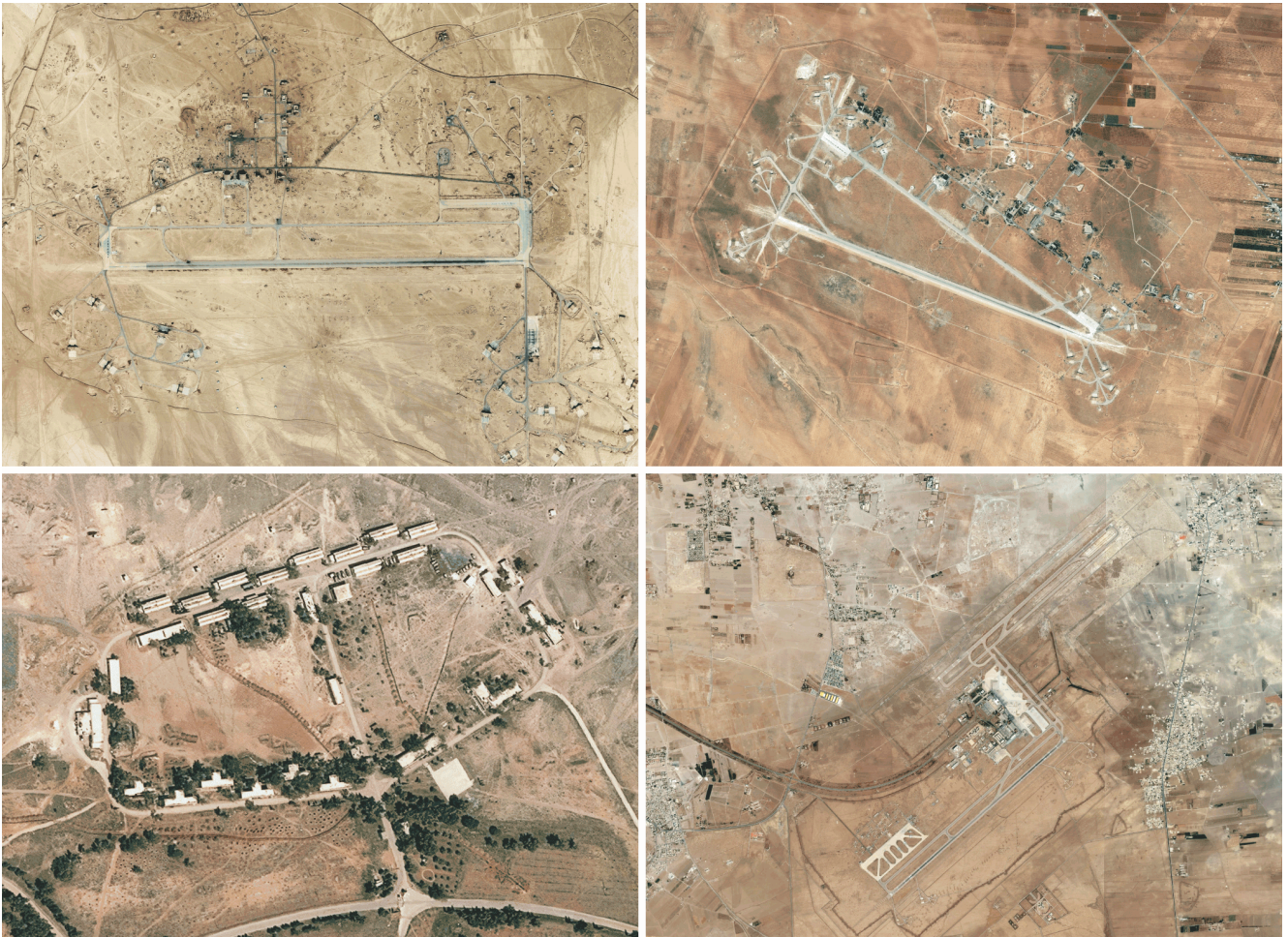
Kiswah base, above: Tiyas air base Damascus Airport, above Al Shayrat airfield