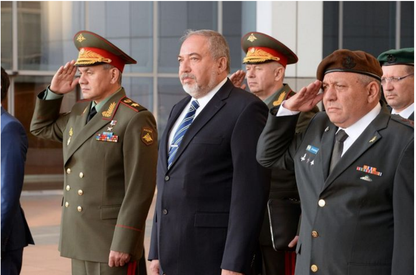
Shoygu, Liberman, Eizenkot Ariel Hermoni, Israel Ministry of Defense