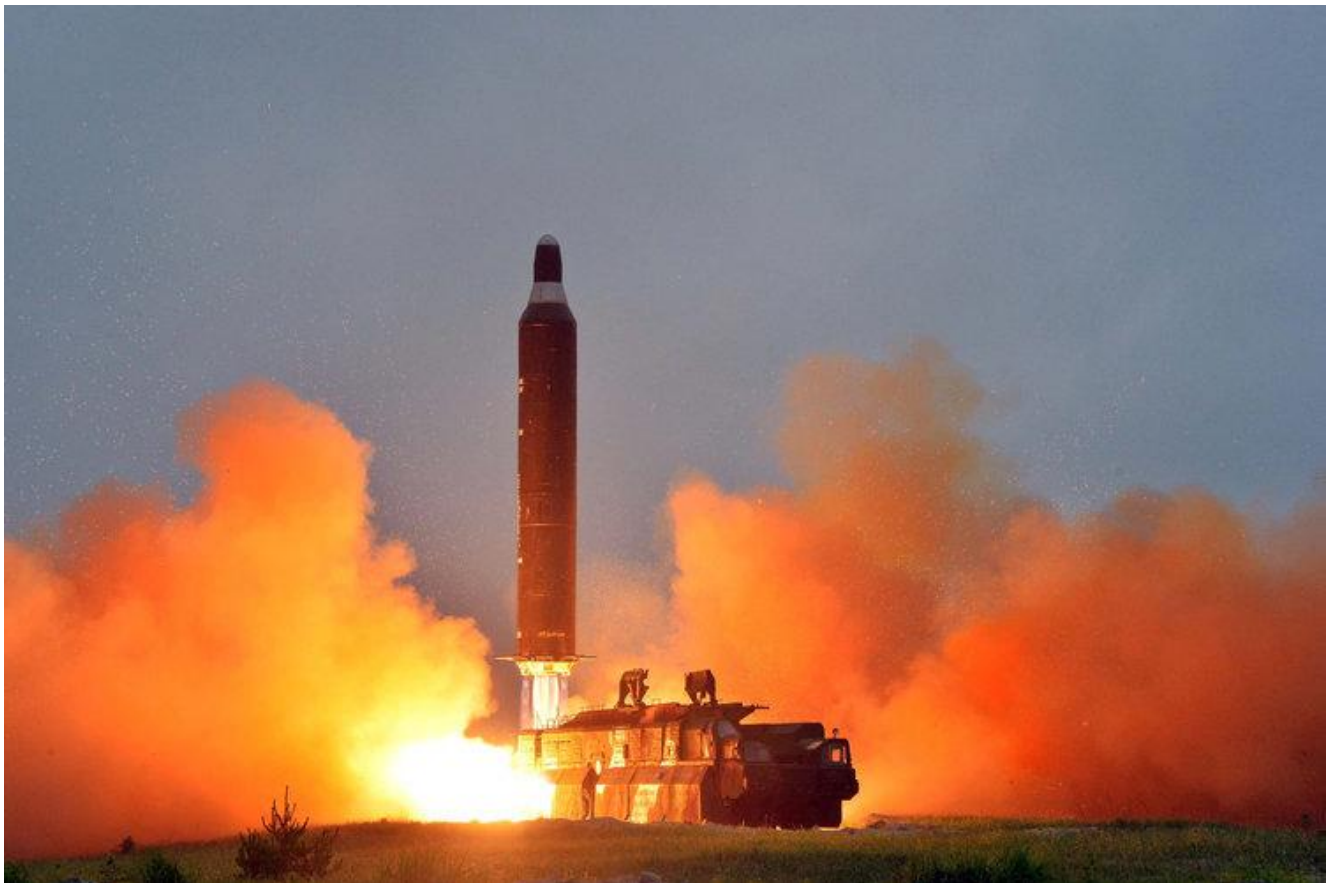
A 2016 North Korean intermediate range ballistic missile test launch.

General Paul Selva, vice chairman of the Joint Chiefs of Staff - the US's number 2 military official, said in an interview that, "Probably the only thing they've advanced is their understanding of mixing and fabrication of solid-rocket fuel," which helps with more rapid reloading of mobile missiles.