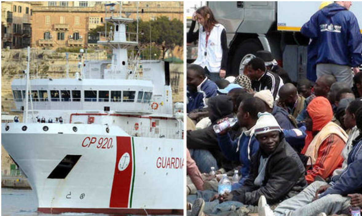
Refugees who fled Libya wait on the quay after disembarking from a boat