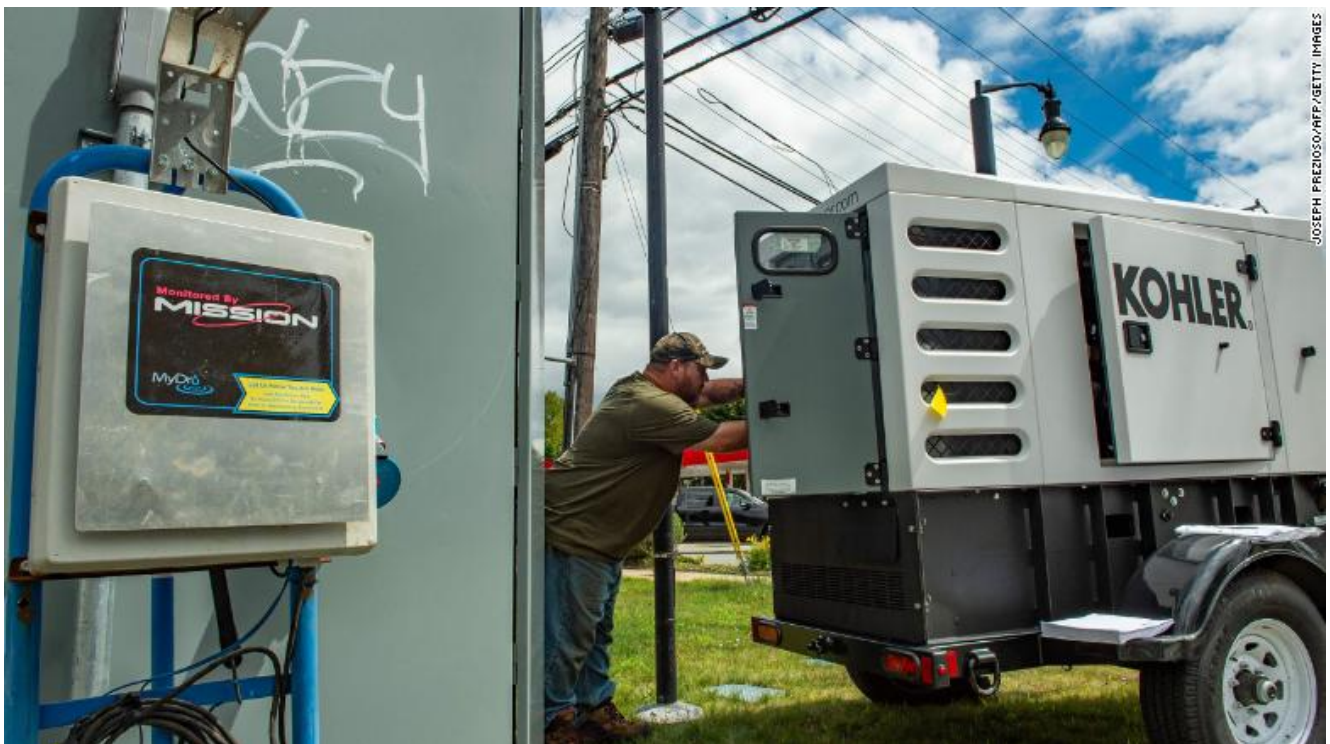
A town employee in Bourne, Massachusetts, connects a generator to a sewage pump in the case of electrical loss as Henri approached Friday.

Rhode Island Gov. Dan McKee urged residents to prepare for the storm and announced he has signed an emergency declaration to unlock federal resources to support storm response.