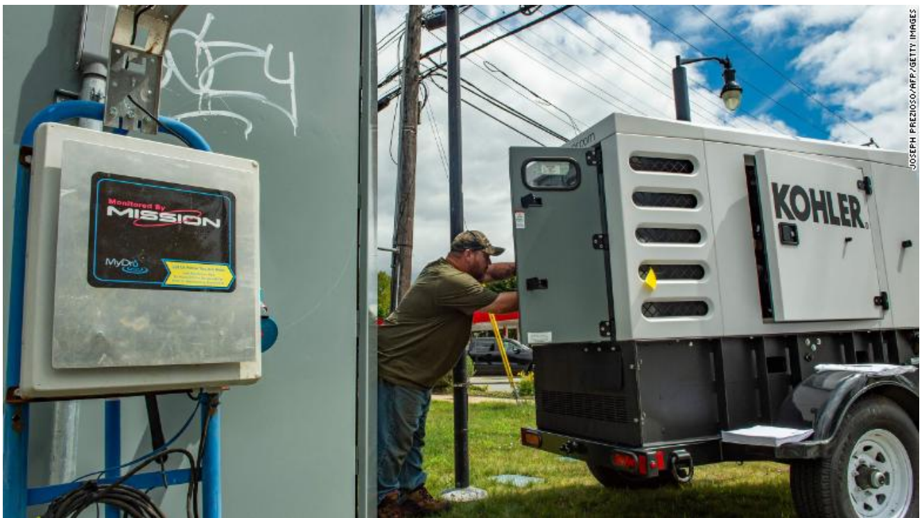
A town employee in Bourne, Massachusetts, connects a generator to a sewage pump in the case of electrical loss as Henri approached Friday.

Rhode Island Gov. Dan McKee urged residents to prepare for the storm and announced he has signed an emergency declaration to unlock federal resources to support storm response.