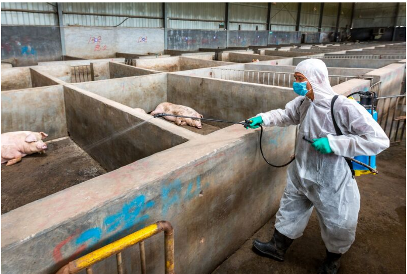
A worker disinfects pigs at a farm in Zhejiang province in August 2018.

Read More: The Deadly African Virus That’s Killing Asia’s Pigs