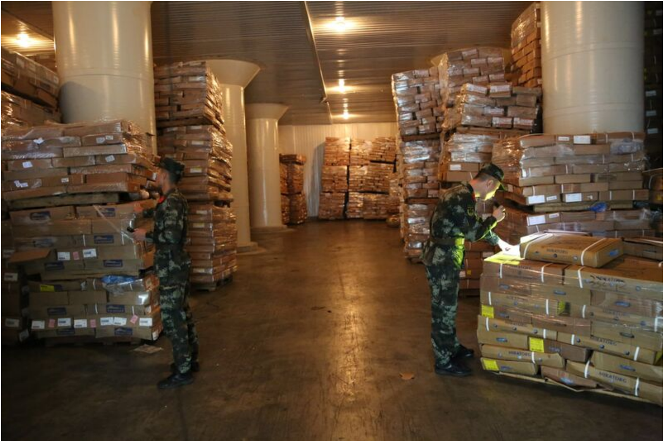
Officers inspect pork products intercepted from high risk areas of African swine fever.

The contagion is also highlighting the urgent need for government investment in outbreak preparedness, said Amanda Glassman, chief operating officer at the Center for Global Development.