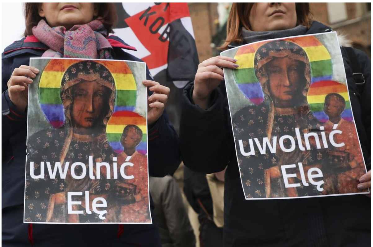
People demonstrate with 'Free Ela' posters in Krakow on May 6, 2019.

Human rights activists slammed Poland's ruling party after authorities detained a woman who allegedly had images of an icon of the Virgin Mary with a rainbow-colored halo resembling the symbol of the LGBT community.