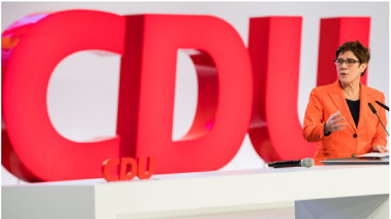
Annegret Kramp-Karrenbauer, leader of the German Christian Democrats.

"The events in Thuringia break a taboo in the history of political democracy in the Federal Republic," SPD Finance Minister Olaf Scholz tweeted. "Very serious questions arise for us with the CDU's federal leadership."