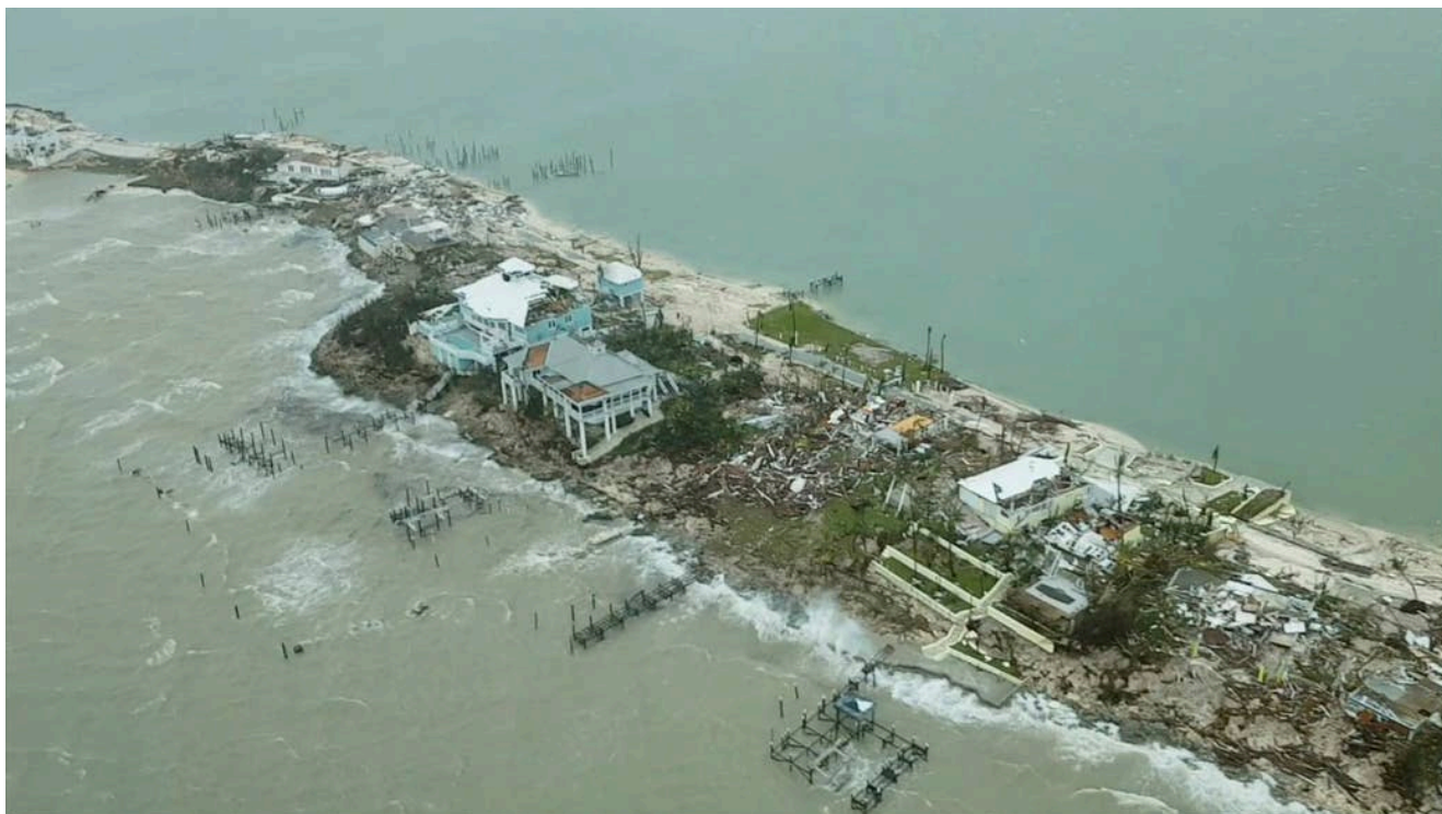
Social media / Terran Knowles / Our News / Bahamas