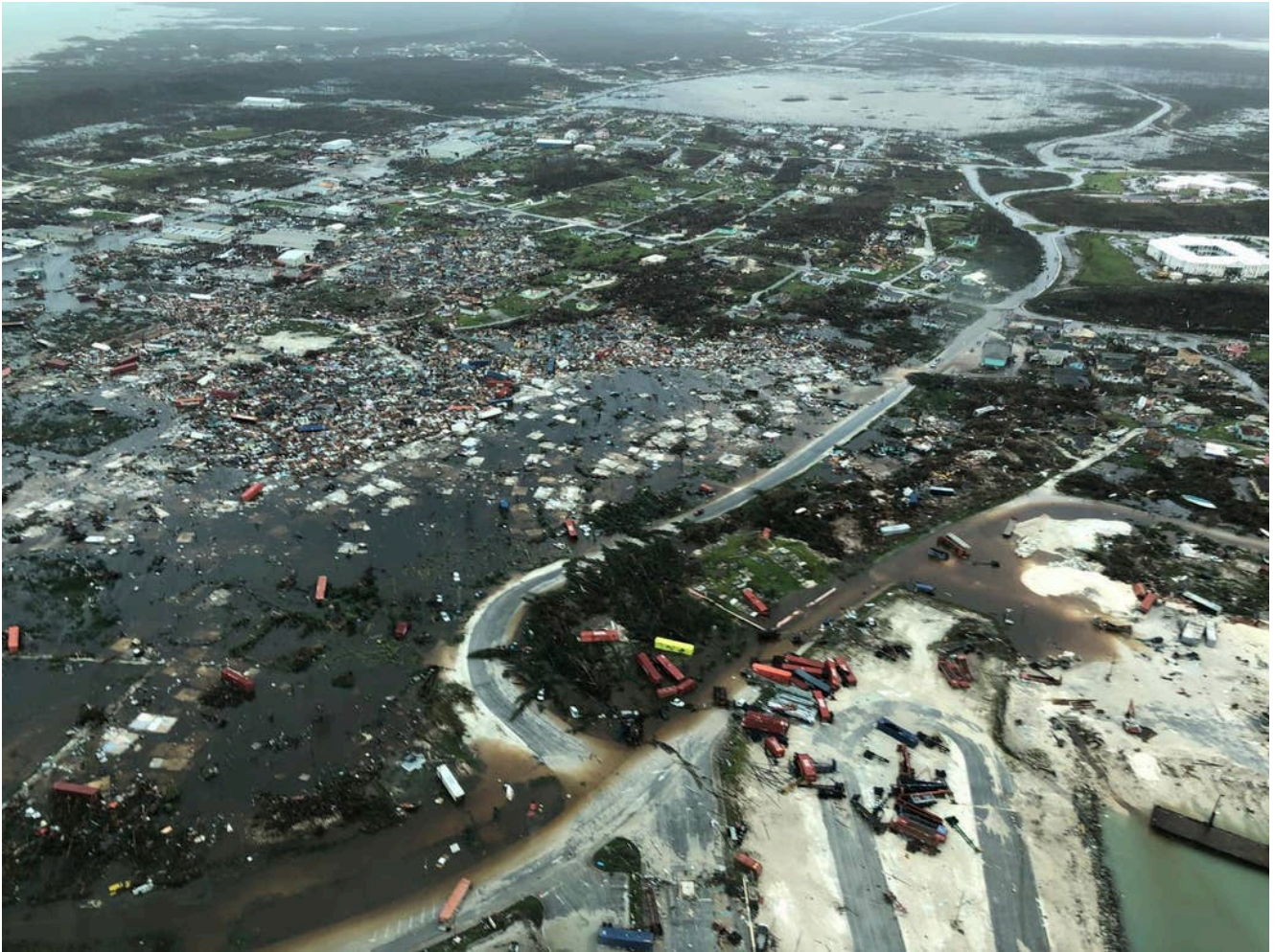
Social media / Michelle Cove / Trans Island Air