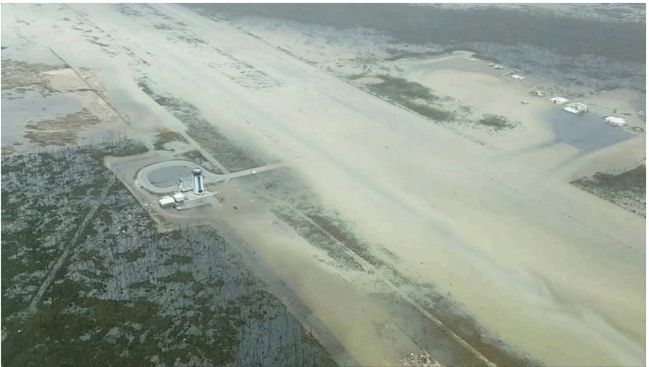
Social media / Terran Knowles / Our News / Bahamas