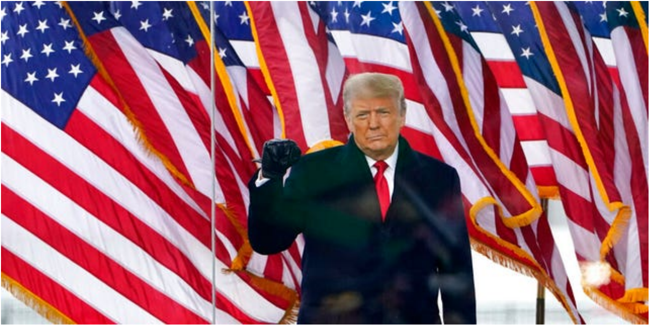
President Donald Trump arrives to speak at a rally Wednesday, Jan. 6, 2021, in Washington.

As the trial begins, Trump's lawyers are also expected to argue that the Senate can no longer constitutionally convict Trump now that he is out of office — and the House impeachment managers are expected to dispute that — in an affair that represents the finale of Trump's tumultuous first term, even as rumors persist he may run for a second in 2024.