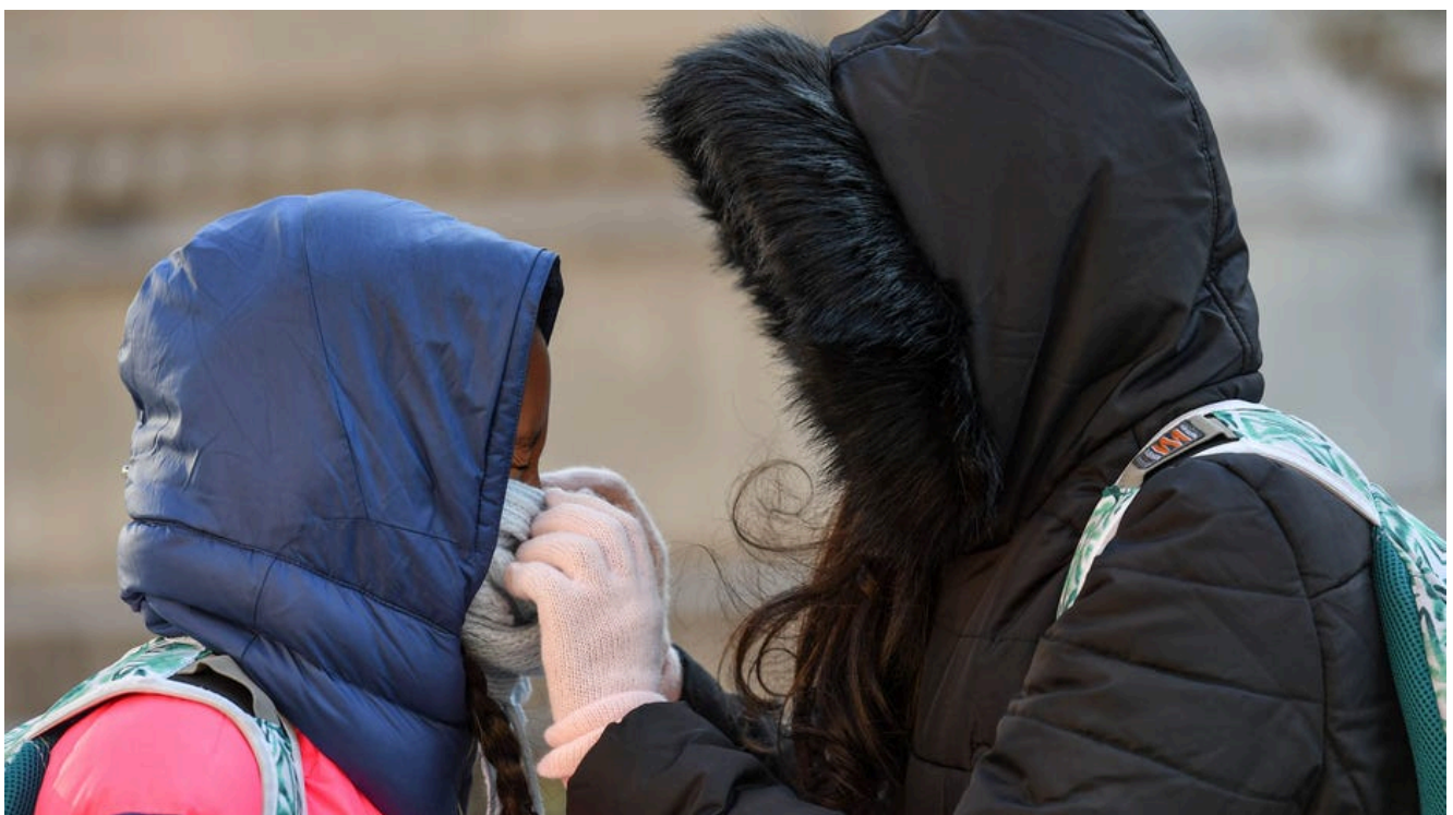
WASHINGTON, DC - DECEMBER 15: Two young girls adjust each other's winter

The National Weather Service is forecasting about 190 potential daily record cold high temperatures between Monday and Wednesday, according to the Weather Channel.