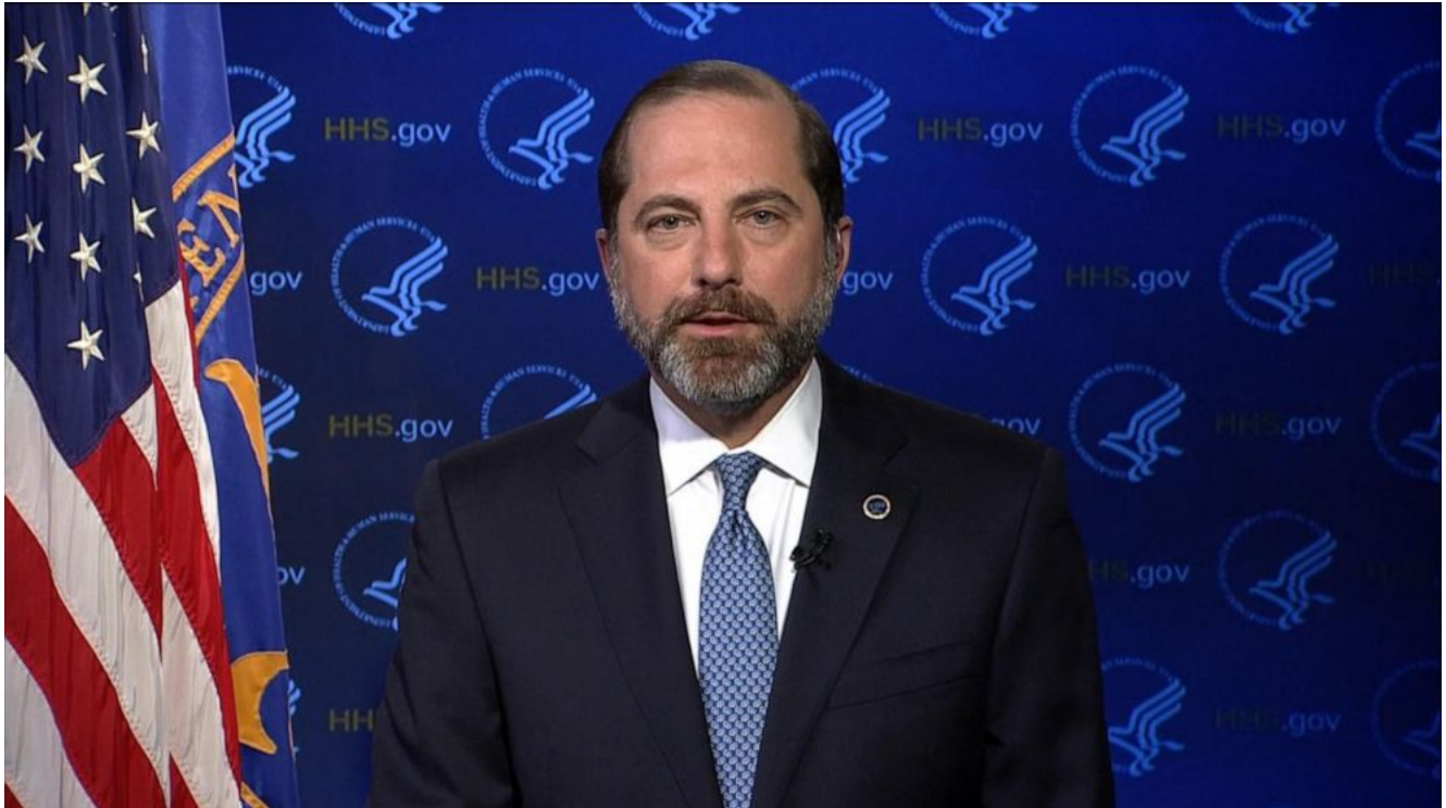
U.S. Secretary of Health and Human Services Alex Azar appears on “Good Morning America, March 11, 2020.

contact with over the past 14 days are quarantined at home,” the agency said in a statement. “Screening checkpoints remain open and the agency is working with the CDC, as well as the California Department of Public Health and the Santa Clara County Public Health Department to monitor the situation as well as the health and safety of our employees and the traveling public. We will update as more information becomes available.”