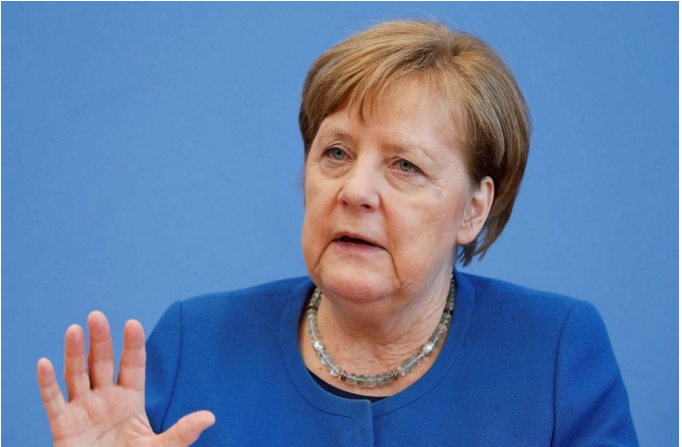
German Chancellor Angela Merkel addresses a news conference on the novel coronavirus outbreak, in Berlin, Germany, March 11, 2020.

The newly identified virus, known officially as COVID-19, has tightened its grip around Italy and Iran, which have the second- and third-highest national totals of confirmed cases behind China, respectively. With 1,311 cases confirmed as of Wednesday night, the U.S. now has the eighth-highest.