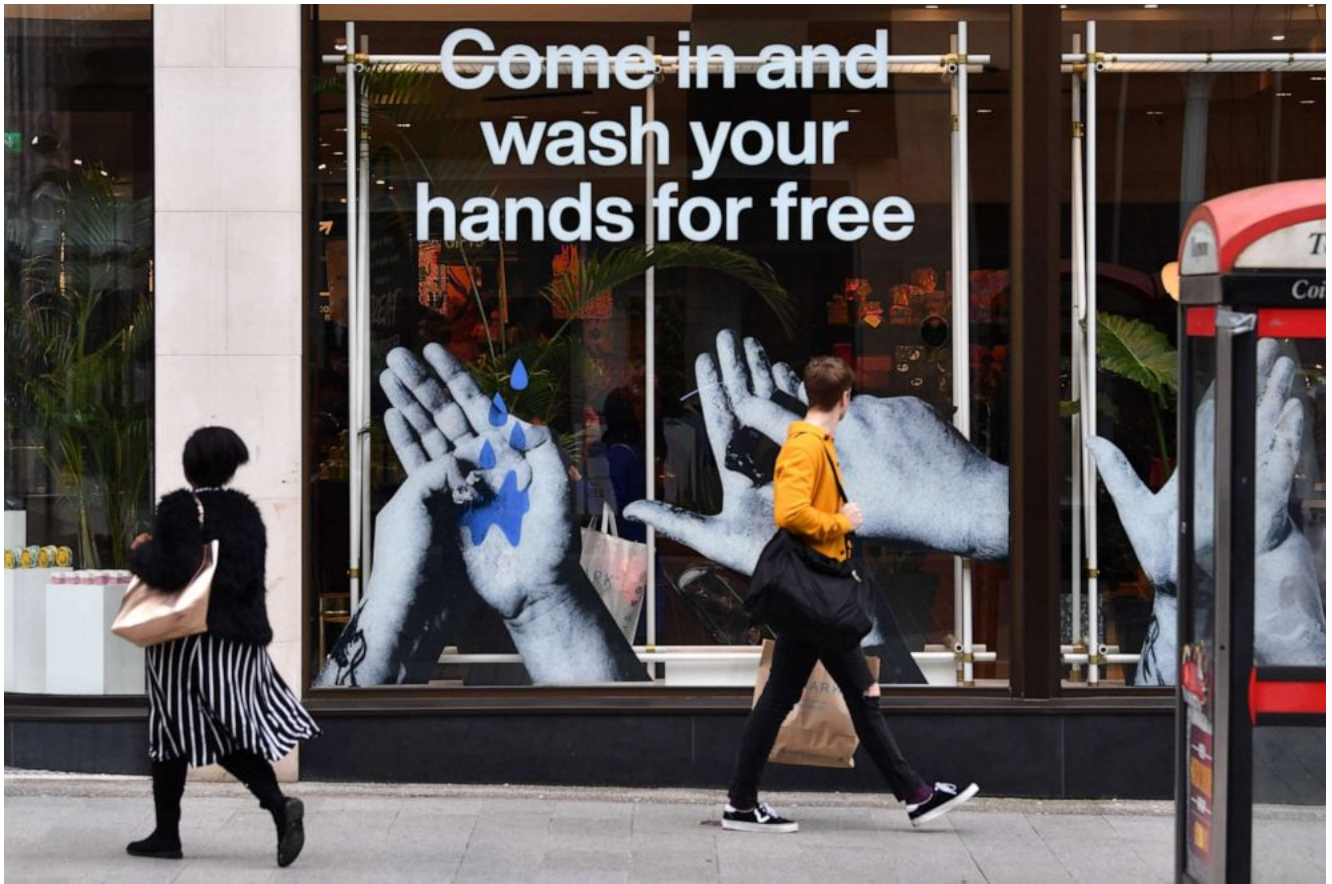
Pedestrians pass a cosmetics shop advertising free hand washing facilities in store in Liverpool, England, March 11, 2020.