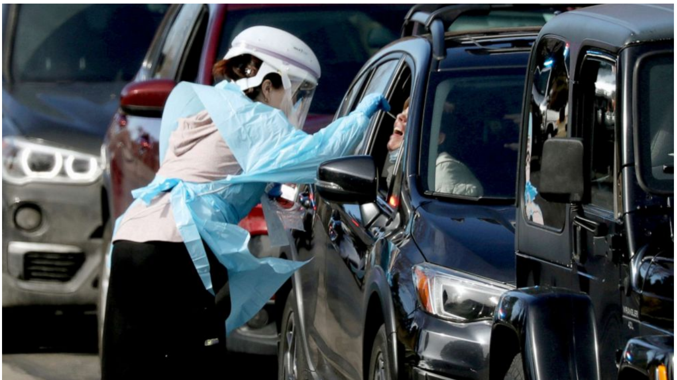
Health care worker tests people at a drive-thru testing station run by the state

MORE: Tracking the spread of coronavirus in the US and around the world